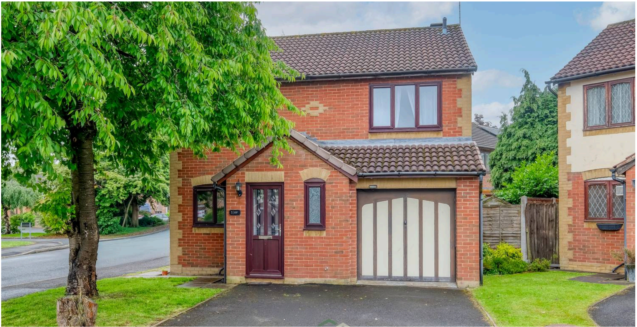
1 Cypress Grove, Birmingham Birmingham