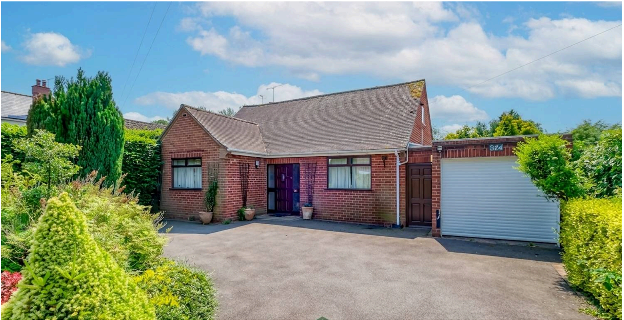
324 Alcester Road, Burcot Bromsgrove