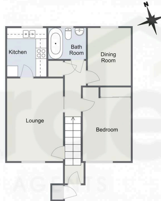
Willow Tree Drive, Barnt Green First Floor