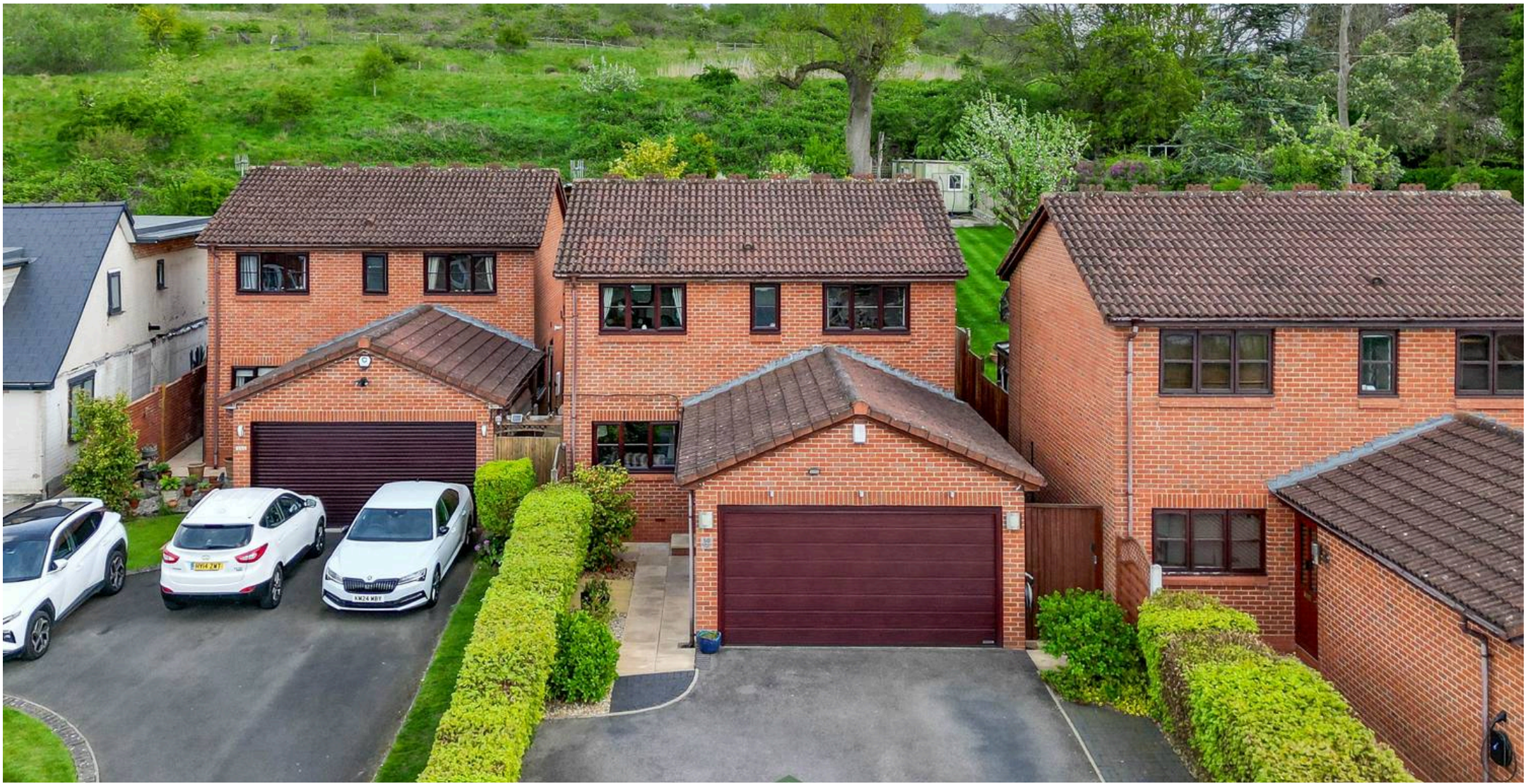
50 Marlbrook Lane, Marlbrook Bromsgrove