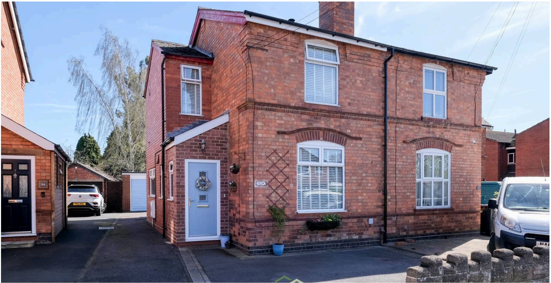
92 Broad Street, Bromsgrove Bromsgrove