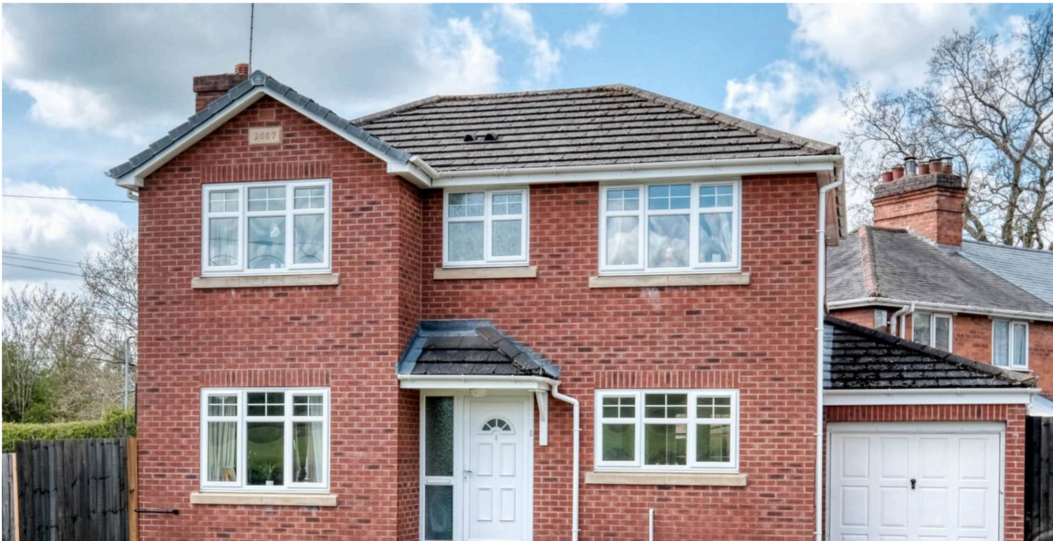
1 Greenfield Avenue, Marlbrook Bromsgrove