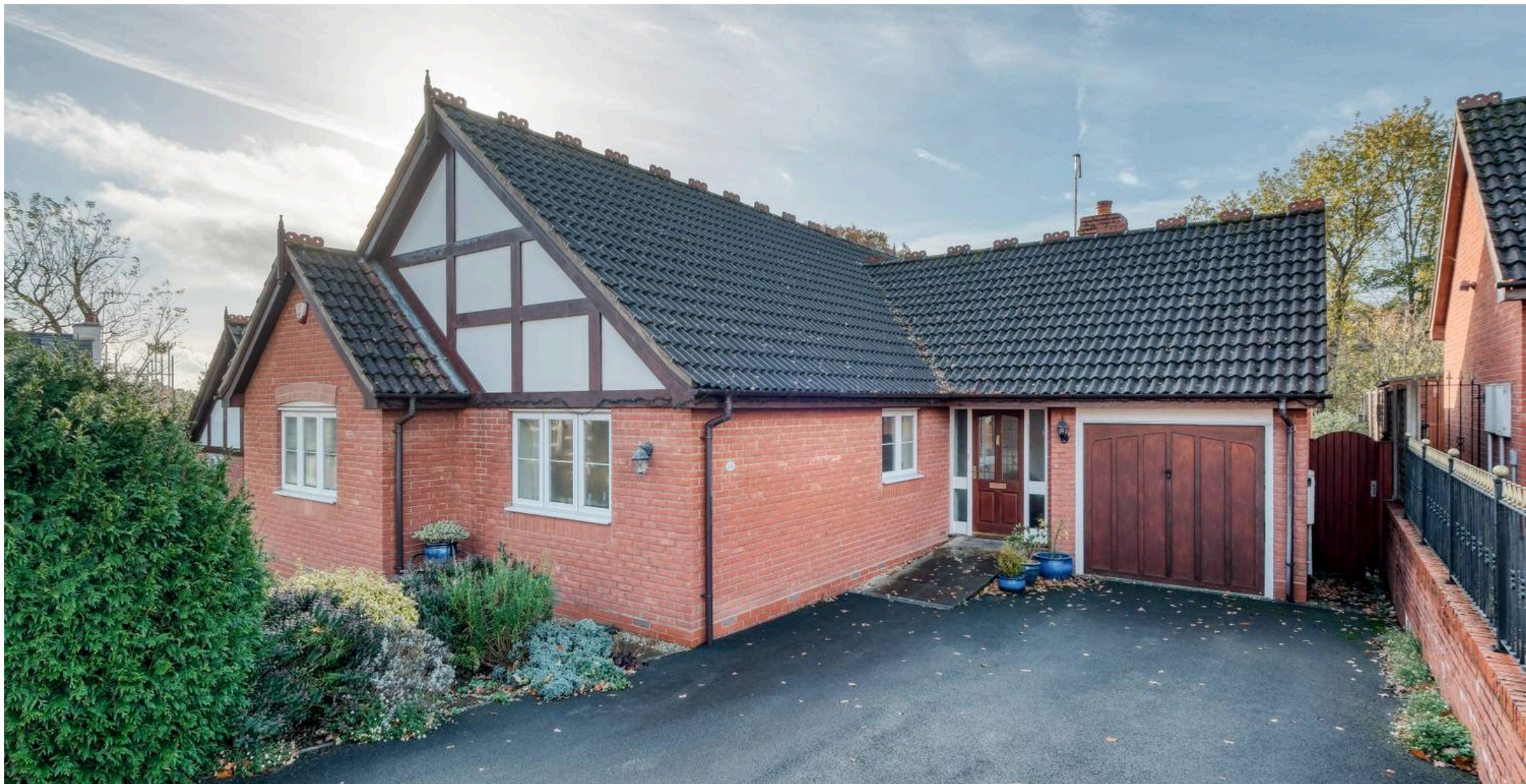
22a Crownhill Meadow, Catshill Bromsgrove