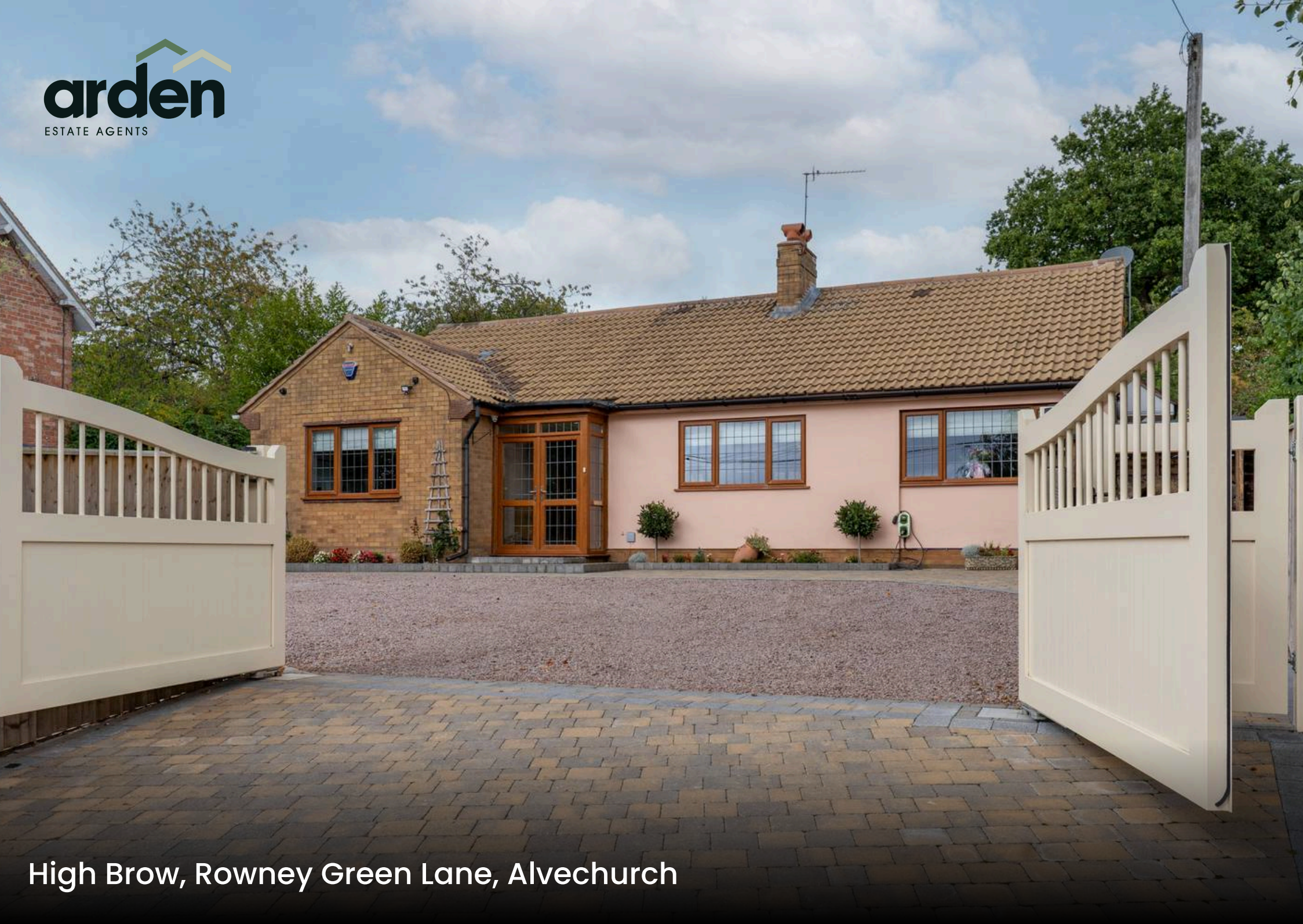
High Brow, Rowney Green Lane, Alvechurch