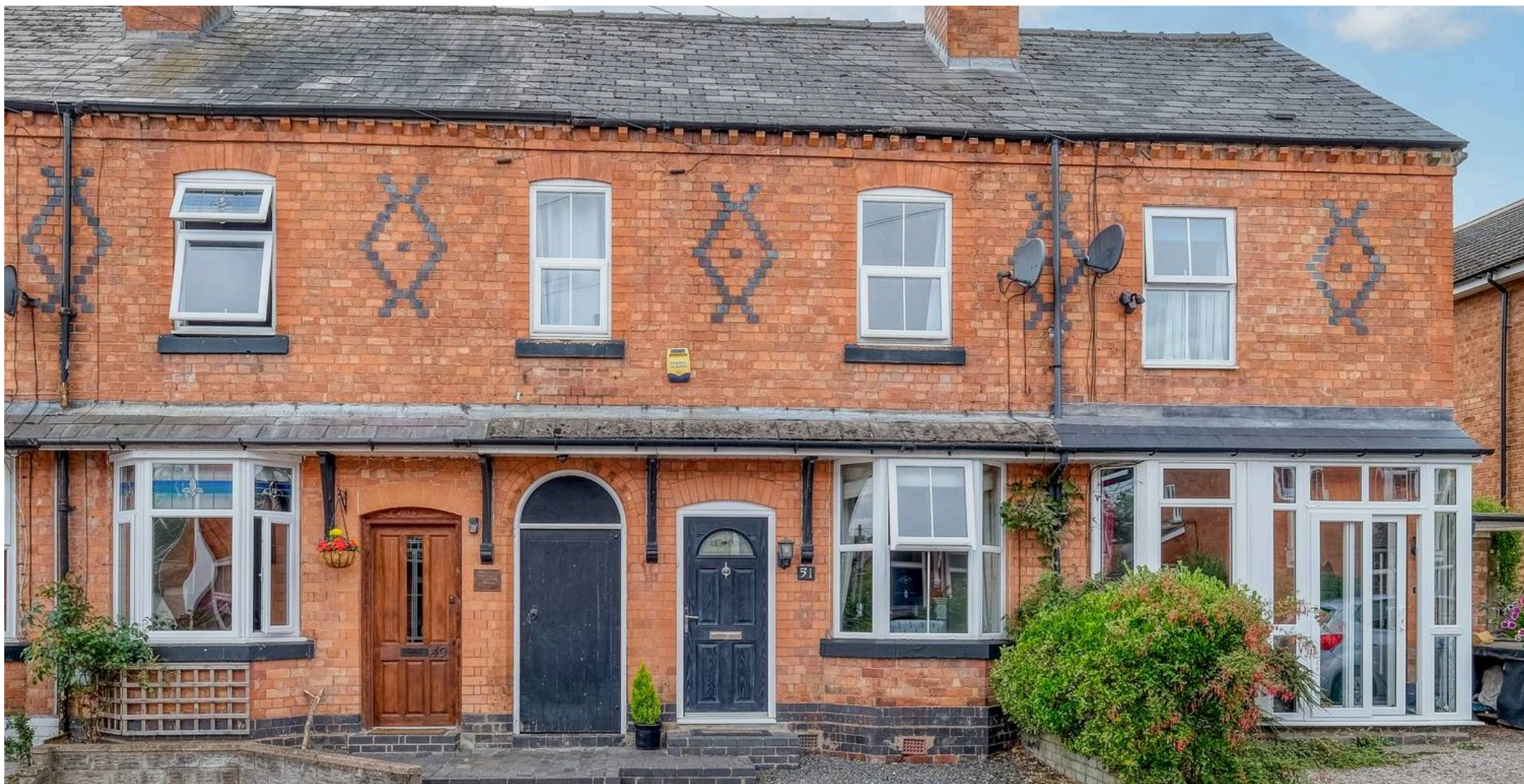
51 Shrubby Road, Bromsgrove Bromsgrove