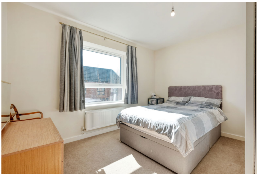
Barn Meadow Close, Northfield, Birmingham Ground Floor