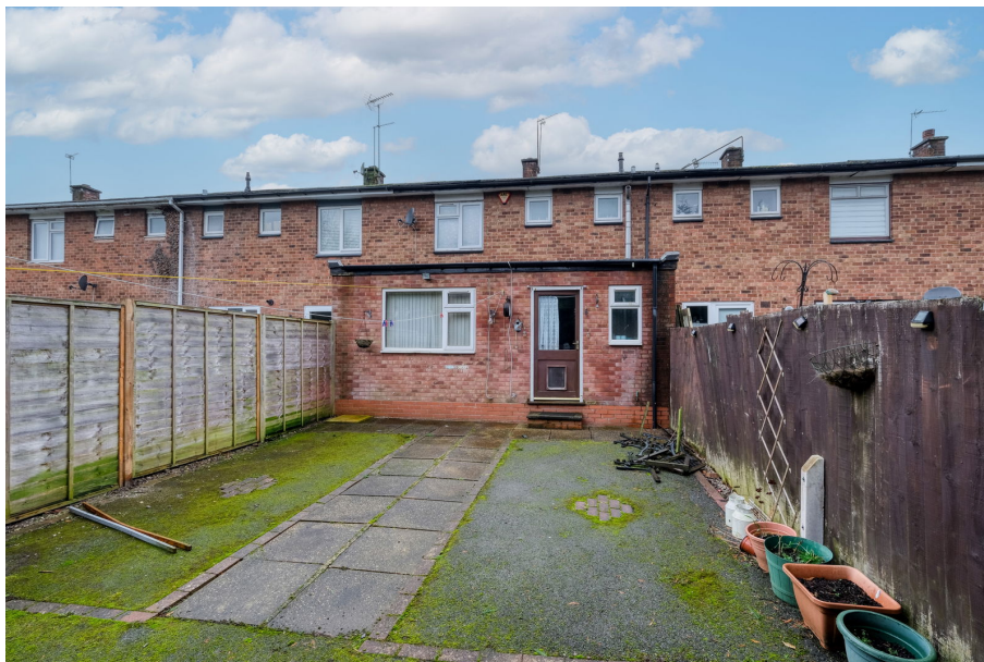
Toll House Road, Rednal Ground Floor