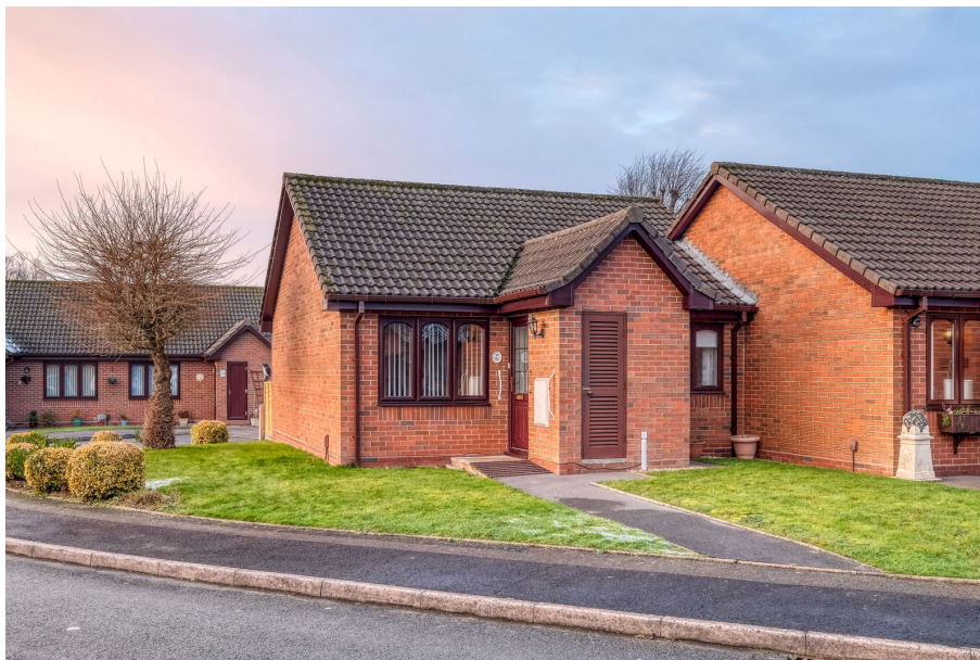
Stonehouse Close, Redditch Ground Floor