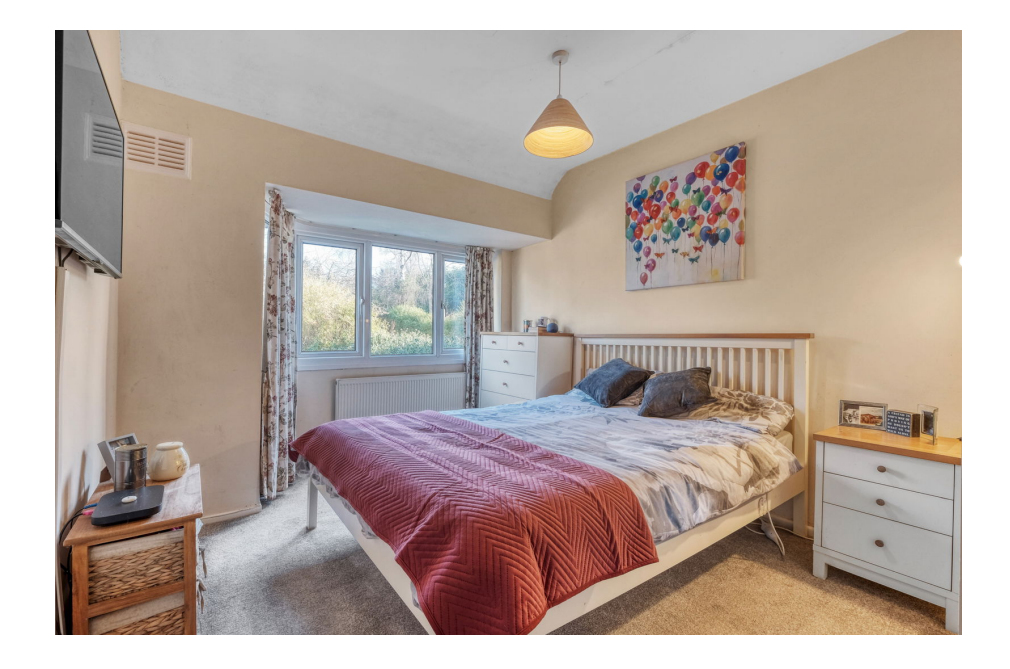
Aversley Road, Kings Norton, Birmingham