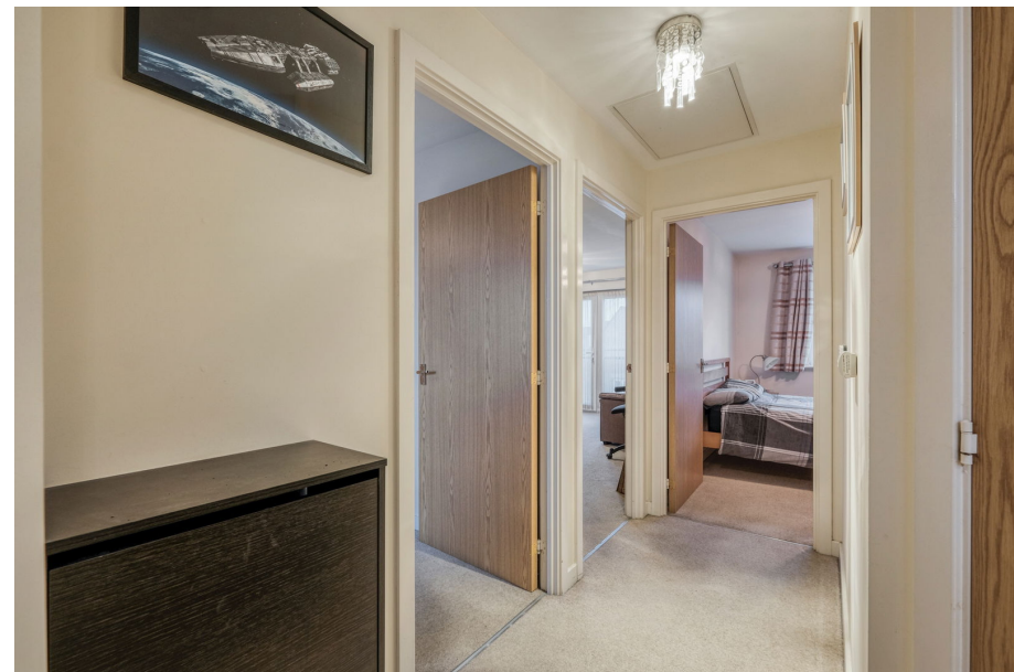
Hollington House, Dixon Close, Redditch

A beautifully presented two-bedroom apartment located on the third floor of a modern apartment block, ideally positioned in Enfield, within close proximity to the town centre and railway station. The property benefits from allocated and visitor parking, as well as well-maintained communal areas.