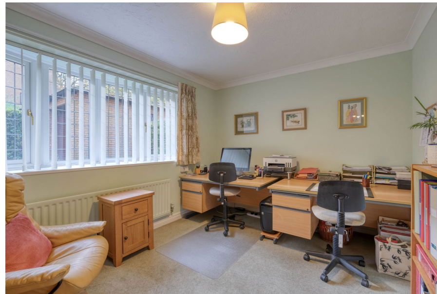
Purshall Close, Redditch

A wonderfully appointed four bedroom detached home, occupying a generous plot, situated in a sought after close in Southcrest, surrounded by the local woodland. The property boasts beautifully maintained and generously proportioned accommodation, a large wrap around private garden, driveway parking and a detached double garage.