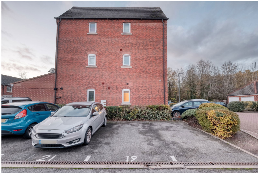
Hedgerow Close, Redditch