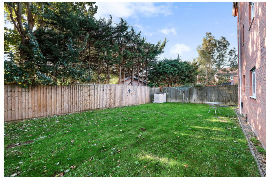
Yeomans Close, Astwood Bank

** Long Lease ** An excellent opportunity to purchase this modern two-bedroom apartment in Astwood Bank, offered with 50% shared ownership. The property boasts spacious accommodation, as well as both allocated and visitor parking.