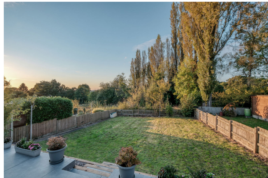
Church Road, Astwood Bank Ground Floor

This stunning four-bedroom detached bungalow, fully renovated to an exceptional standard, is located in the heart of the desirable village of Astwood Bank and is offered with no upward chain. Having undergone extensive refurbishment, the property features spacious, well-designed interiors, an attractive rear garden, and a generous loft room, offering excellent potential for conversion.