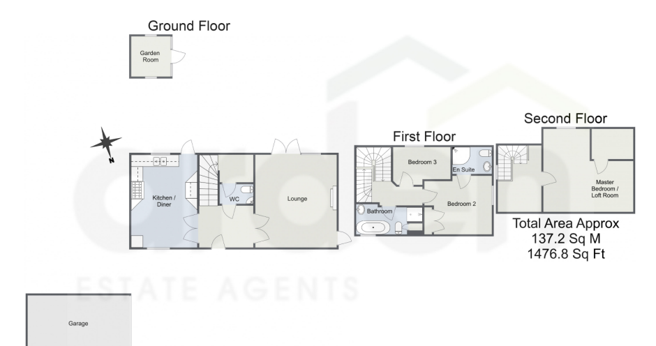
For illustrative purposes only. Decorative finishes, fixtures & fittings do not represent the current state of the property. Measurements are approximate & not to scale. Finor Plans made using Romor&latcher.