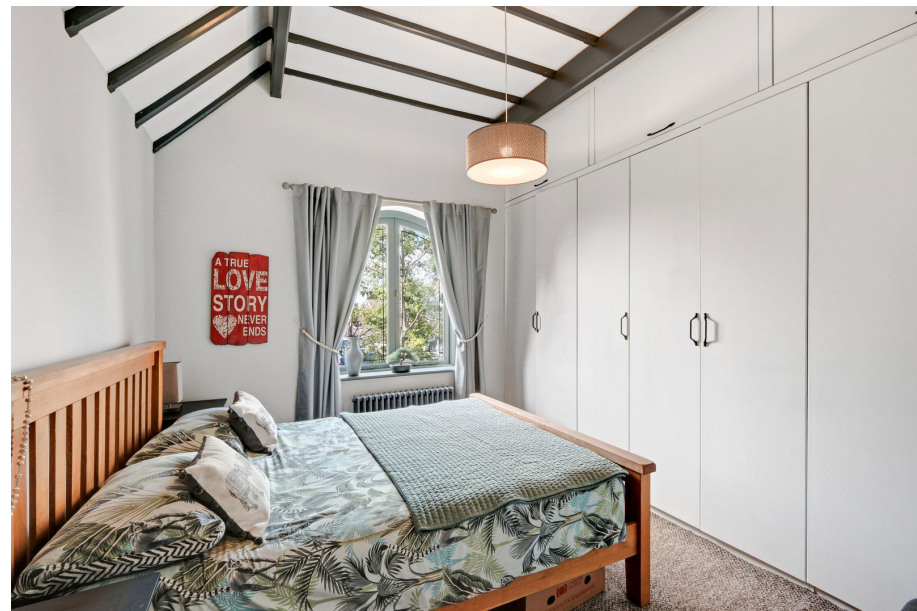
Evesham Road, Redditch Ground Floor

A truly unique opportunity to purchase 'The Castle', an imposing detached property, rich in history. Featuring original elements from the 1700s, the property has been thoughtfully expanded over the 19th, 20th, and 21st centuries, and sympathetically restored by the current owners over the past nine years to offer a meticulously crafted family home.