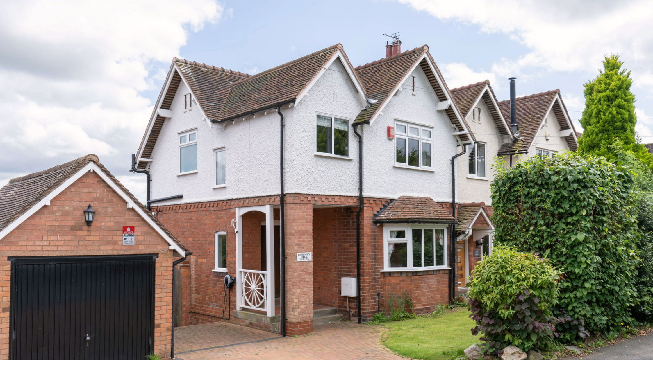
Rowney Hill House, Rowney Green Lane, Alvechurch, B48 7QS