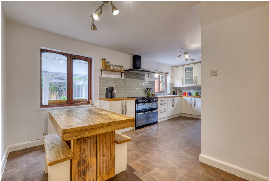
Longfellow Close, Redditch Ground Floor