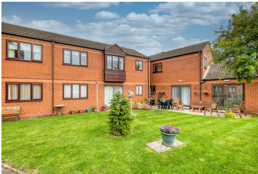
Eastwood Court, Foregate Street, Astwood Bank