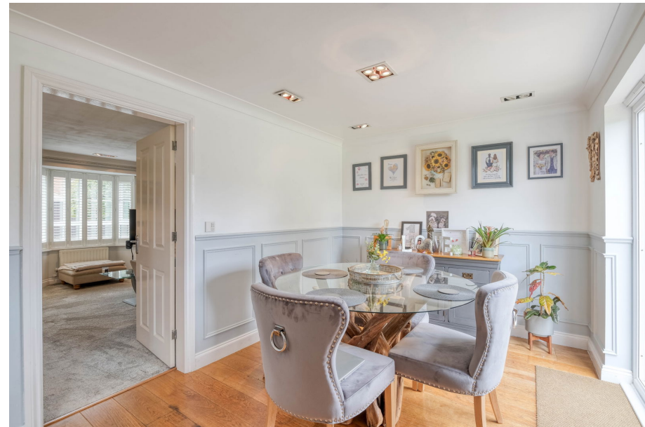
Yeomans Close, Astwood Bank

A wonderfully appointed four-bedroom detached family home in Astwood Bank village, enjoying views of the neighboring countryside. The property offers stylish and well-proportioned accommodation, a beautifully maintained rear garden, driveway parking, and a garage.