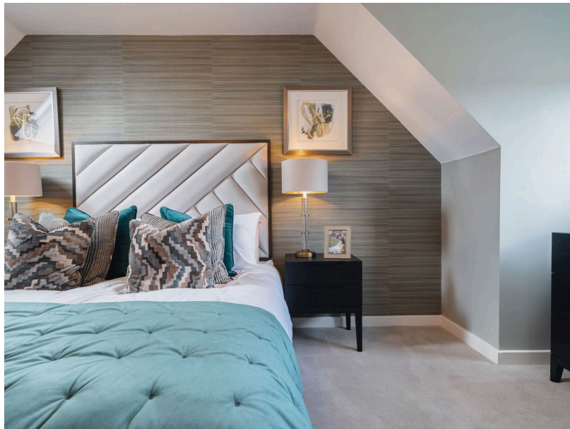
Plot 90, Lucas Green