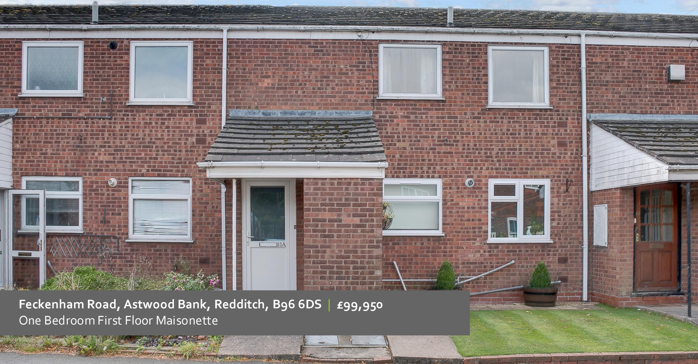
Feckenham Road, Astwood Bank, Redditch, B96 6DS | £99,950 One Bedroom First Floor Maisonette