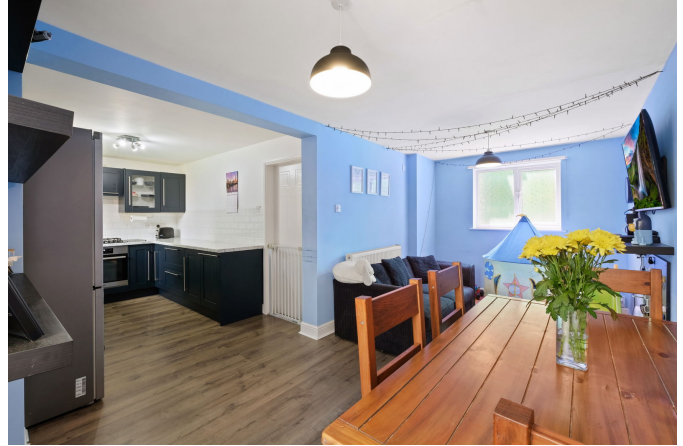
Woodcock Close, Northfield First Floor